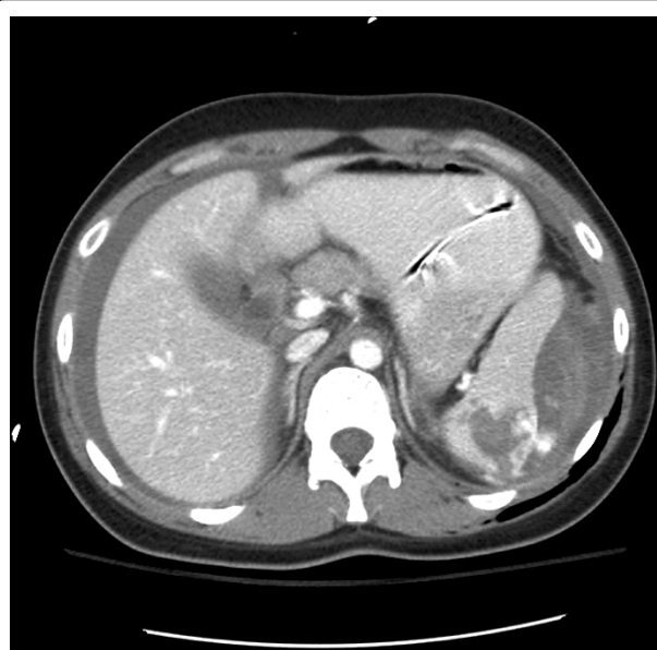
Figure 2 Abdominal CT scan of same patient revealing active contrast extravasation at 08:13 am.

from 2001 and one case from 2003). Five patients who failed SNOM also developed active extravasation present on follow-up CT scans which were done nine hours (Figures 1 and 2), two, seven, nine, and ten days after admission. Overall, 11 of 53 (21%) failures of SNOM revealed acute vascular extravasation. A more detailed comparison between those patients treated successfully compared with those who failed SNOM is also presented in Table 1.