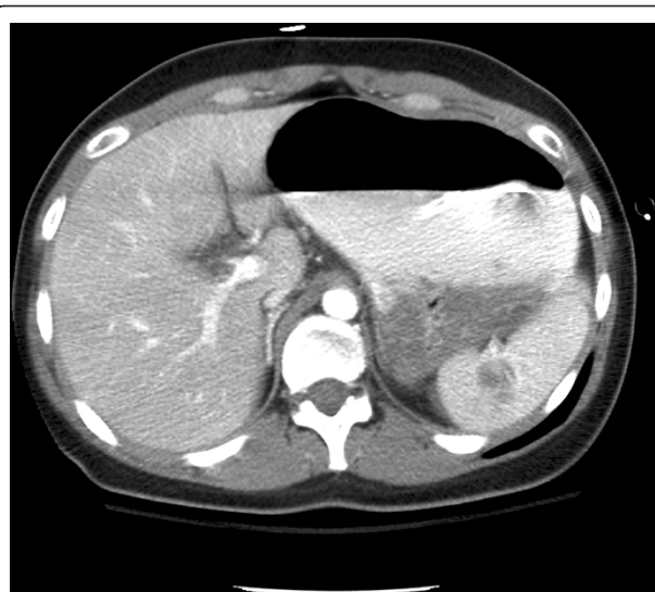
Figure 1 Abdominal CT scan of parenchymal splenic laceration without obvious vascular injury at 01:16 am.

Six patients had an active blush or suspected pseudoaneurysm on the initial CT scan upon which SNOM would presumably be based. Of the six patients for whom SNOM was attempted without addressing the blush or early pseudoaneurysm, one may have been related to an inadvertent delay to OM, with the remaining five cases occurring early in the series (four cases